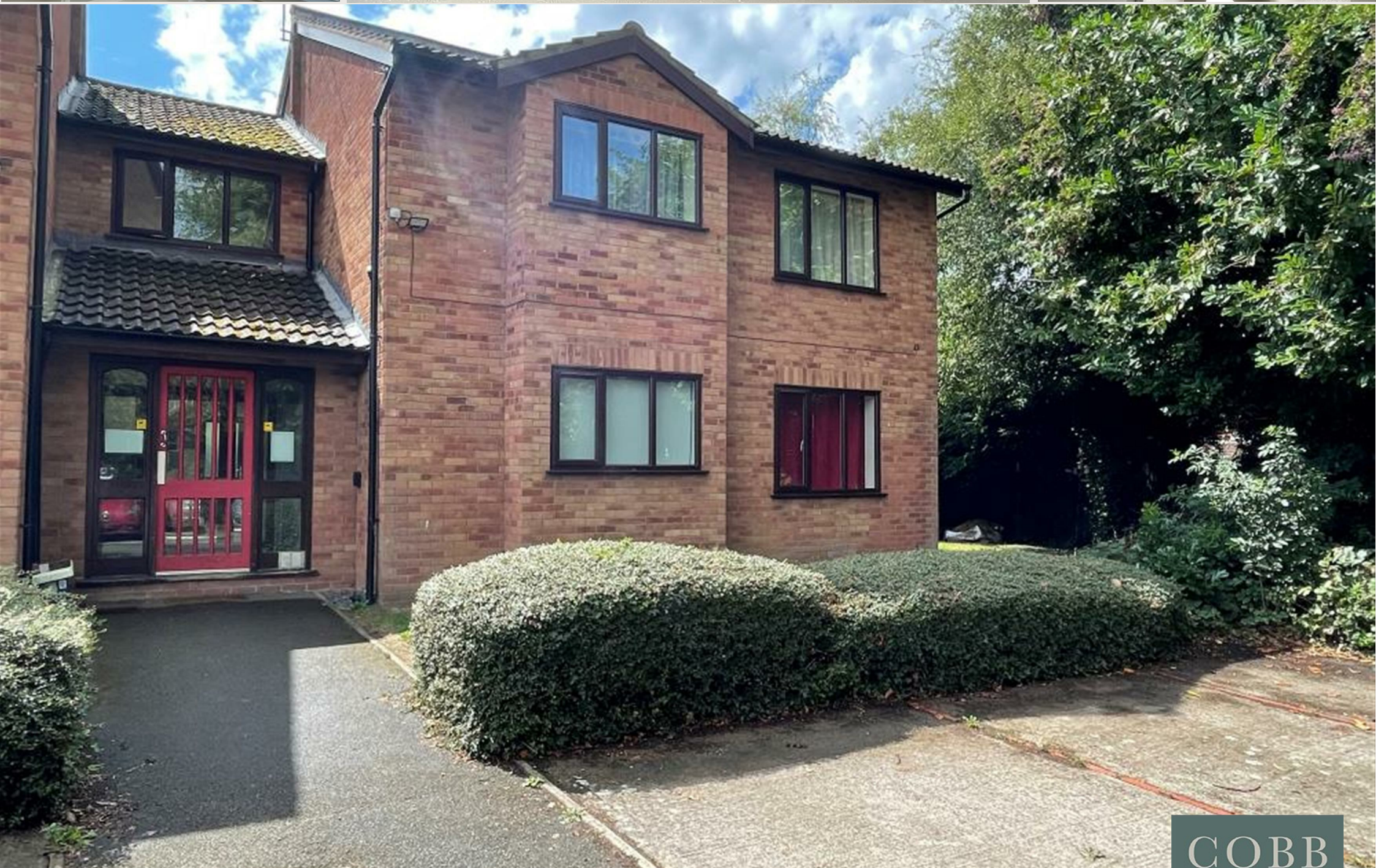
12, Belmont Court, Hereford, HR2 7LR Price £99,950